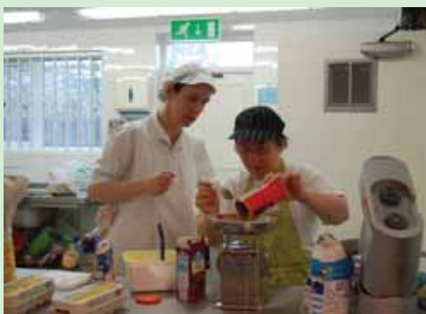
Stepping Stones Disability project in Birmingham

The project is run out of a small community centre and provides wholesome, affordable food for local residents, including many pensioners. This project therefore provides a service and social interaction for the elderly, building the community as well as training those with disabilities, giving them a ‘stepping stone’ to the wider workplace. The project builds self esteem in its staff and gives them a sense of purpose