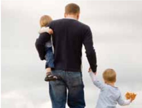
Fathers can have an active role to play in childcare choices

Increasingly, it is publicly acknowledged that there have been injustices for fathers who have not been able to have sufficient contact with their children for various reasons. Contact orders may well be made by the courts in favour of the parent without residence 82 but a breach of such order is not easy to remedy because draconian enforcement (such as imprisonment for contempt) can materially harm the children and their relationship with the absent parent.