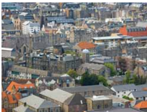
British housing stock is stretched and building land is at a premium

Local authorities can also facilitate access to people at key life stages through primary care trusts, primary and secondary schools, and social services. As stated in Chapter 1, the implications of this greater load on local authorities should be thoroughly thought through by an Implementation Working Party which would include appropriately senior members of the Local Government Association.