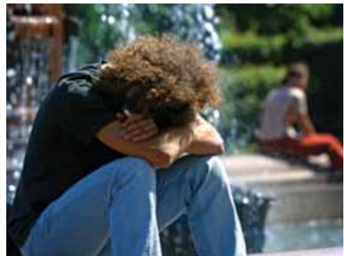
Mental health impacts relationships

'Low-income families, especially those who reside in poverty neighbourhoods, are daily exposed to a variety of experiences that place extraordinary stress on the couple and family relationships. In addition to the constant stress of making ends meet financially, and of working in unstable, low paying jobs, they have the frustrations of living in sub-standard housing in poorly serviced neighbourhoods, without adequate transportation, and they and their children are continually in fear of crime and violence. Members of their immediate or extended families may be struggling with depression, alcoholism or drug abuse, HIV/AIDS, or may be in and out of jail or some combination of those problems. Domestic violence is more prevalent in low-income households. Service providers who work with these couples note how often these accumulated stresses spill over into home, and anger and frustration too often poison their relationships between parents and children.' (Ooms 2002)