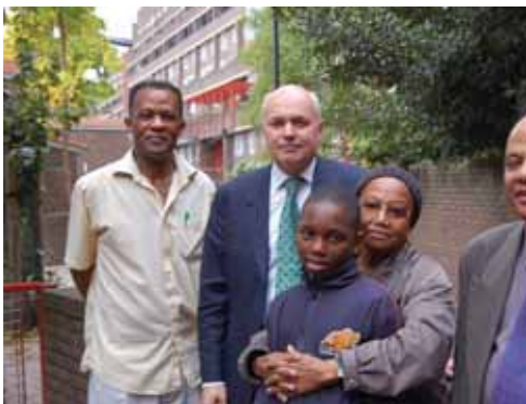
Political focus should take a holistic family view. Iain Duncan Smith meeting families on the Brixton Moorlands Estate

importantly, to back up those signals with necessary action cannot be said to be supportive of the family. We therefore recommend the following: