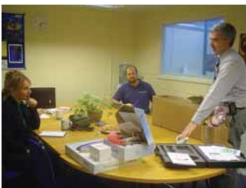
Family group visiting the Josian Centre, Southampton.

A hub equivalent to the Josian center in Southampton in every parliamentary constituency would cost £65m in annual rent. However although centralised hubs bring increased costs for new services, they also bring considerable efficiency gains to both provider and user by putting many services under one roof.