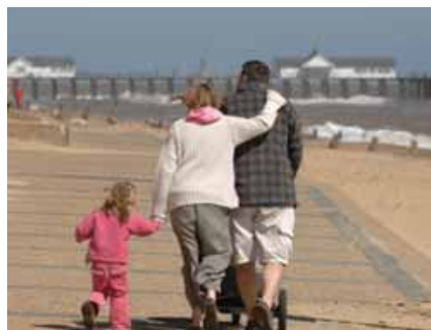
Supporting families so they can thrive

We have tried to take a step back and determine how the tide of family breakdown (dysfunction, dissolution and dad-lessness) might be turned in our generation – because this is not the work of one government, however long its term in office. This baton must be passed onto successive governments of different colours and thus have appeal and resonance across the usual political divides. The Family Breakdown Working Group was largely composed of academics and practitioners who were independent of any political party. Throughout the consultation process we tenaciously clung to the remit we were given from the outset that this was not to be a body of Conservative policies but a manifesto for stronger families throughout Britain. (Indeed we were repeatedly encouraged to develop just that by the Chairman, Iain Duncan Smith.) As such, and because we are convinced that all politicians have got the best interests of the nation's families at heart it is our belief that a new consensus can be build around the family which will gradually replace the contested discourse to which we have all grown accustomed.