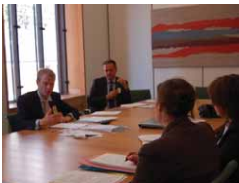
The Family Breakdown Working Group invited many organisations to give evidence for the Fractured Families report.

The number of divorces in the UK doubled between 1960 and 1969 and doubled again between 1969 and 1972, following the 1969 Divorce Reform Act. In 2005 the figure stood at 141,750 for England & Wales. 9 Current estimates suggest that 28% of all children will experience parental divorce by the time they are aged 16. As Fractured Families made clear however, of even greater concern is the markedly more unstable nature of cohabitation and the growing tendency for parents not to live together at all. The Millenium Cohort Study indicates