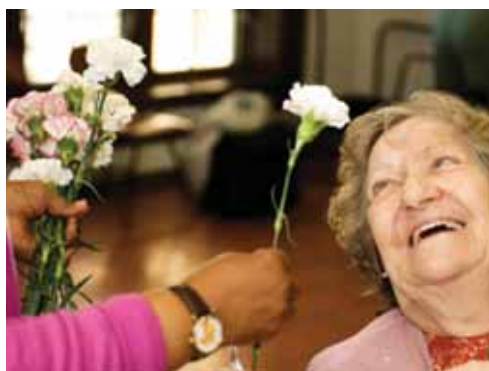
Carers should be adequately recognised for the work they do.

The rationale for raising the UK’s low level of Carers Allowance rests on the fact that this allowance, in reality, recompenses a very high level of work . The Economic Dependency paper (4.2.1: Fair Level of Support for those that truly cannot work) describes the importance of active benefits and an underlying expectation in the system that there should be ‘something for something’. This benefit already meets such a criterion. In addition, the carer is potentially saving the state the large amount of money which outsourced care would cost and that should be taken into account. 58 The UK lags behind other nations in supporting informal care. For example Ireland last year greatly increased its Carer’s Allowance to £135 for one person being cared for and £200 for 2 people.