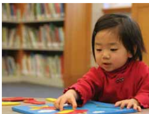
Child nursery centres