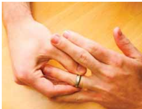
Separation is a reality of our times.

However, in so doing, we have been very concerned to avoid current policy's tendency to ignore the dictum that 'a sound polity has to be built around respect for the autonomy and privacy of the private realm' (Dench 2003). In order to build stronger families, which will be less prone to dissolution, dysfunction and dad-lessness, in many ways we need to give responsibility back to the families rather than impose 'good practice' from the centre. We also want to acknowledge from the outset that many families and parents do a good job, and that our proposals aim to build on their work, not to supplant it. We are certainly not recommending greater state intervention in the family, and would argue the need to 'roll back' that frontier.